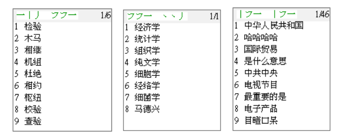
Fig. 4: The user interface of the G6 MS-Windows

The ALIC means the average length of all input codes, so the lower the ALIC is, the faster the input method should be. The second column of Table 1 listed the ALIC of the input methods used in our analysis, which shows that G6 can reduce the ALIC from 9.388 of simplified characters set and 11.473 of traditional characters set to 5.798 and 5.859, respectively. G6's ALIC is longer than the Pinyin, Zhuyin, Wubi, Cangjie and CKC by 2 but the ALIC may not be a good parameter for comparing the input speed of G6 with these non-stroke-based Chinese input methods. It is because the actual number of keys pressed to input the character couldn't be reflected by ALIC if the character-to-code collision rate is very different.